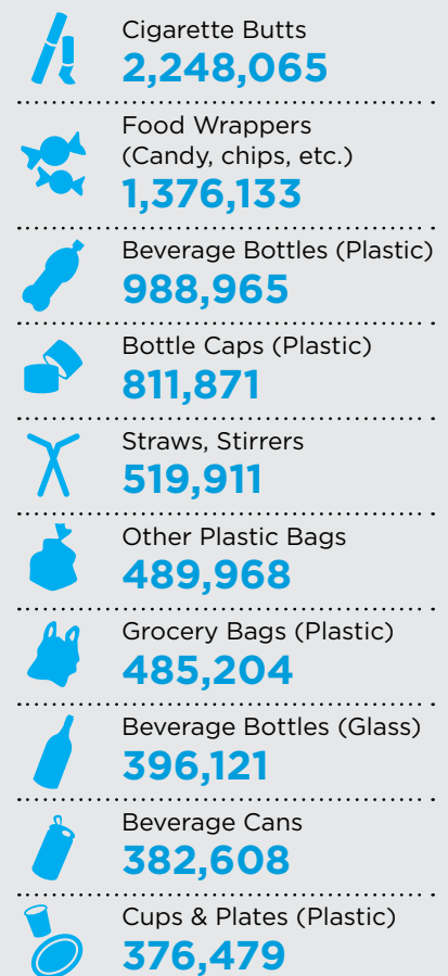
Source: Ocean Conservancy International Coastal Cleanup, 2015